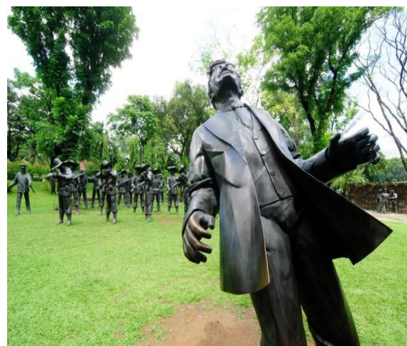
Martyrdom of Dr. Jose Rizal