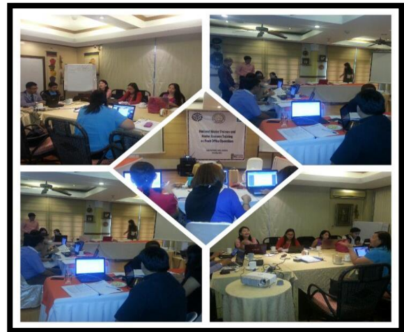
National Master Trainers and Master Assessors Training on Front Office Operations held at Subic Park Hotel last July 2015

For the Tourism Industry Skills Development, final report on the implementation of Phase 1 of the Industry Skill Grant Scheme was already completed.