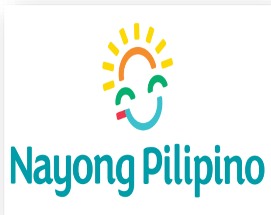
The new logo of the Nayong Pilipino

Nayong Pilipino Foundation (NPF) continued to promote Philippine heritage and culture through conduct of year round activities such as educational tours as well as mounting of cultural performances featuring the Nayong Pilipino Dance troupe and Rondalla which showcased the beauty and ethnicity of Philippine folkdances and music to the delight of foreign guests, local visitors and students. Also, to bring new face to the organization, a new company logo and rebranding was introduced in 2015. The branding of fun and Philippine culture are easily conveyed through the playful smile and a face similar to the Masskara festival mask which is symbolic of the Filipino's fun and festive nature.