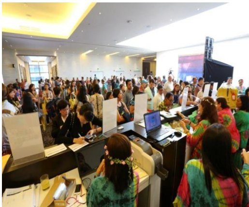
Busy day at the registration area of the Philippine M.I.C.E. Conference 2015 on its first day

For 2015, TPB has implemented 50 invitationals/familiarization trips to showcase various tourist destinations such as Boracay, Davao, Manila and Environs, Cebu, Bohol, Palawan, and Tagaytay. Special projects were also implemented such as Visit Bohol 2015; It's more fun in the Philippines, Korea Golf Show, Country Commitment, FOBISIA Games 2015, Korea Golf Show, Country Commitment, and two (2) Domestic Special promotions. It also participated in 16 international Trade and Consumer Fairs, three (3) domestic trade and consumer fair. TPB also hosted APEC 2015 Welcome Dinner Shows held in Clark, Pampanga and in Tagaytay, Cavite.