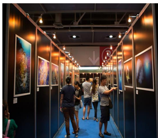
Visitors to the DRT Philippines Show flock to the Underwater Photo Gallery to view underwater photos taken in the Philippines by top underwater photographers

A photo gallery with over 100 underwater photographs taken by several of the country's top professional underwater photographers and cinematographers were exhibited during the event.