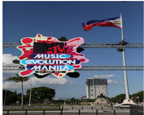
MTV Music Evolution Banner displayed at the venue, Quirino Grandstand, Rizal Park, Manila

24 to 26, 2015. Some of the favorite local chefs and Michelin-starred Spanish chefs participated in this event. The conduct of food tours and tastings, roving food trucks were likewise all part of the said event.