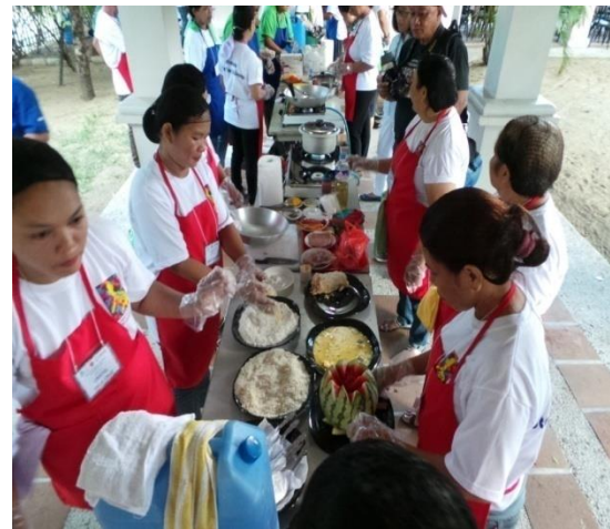
Street vendors in Intramuros learn about food preparation

IA organized a total of six (6) co-sponsorship shows and events such as Papal Visit, Redhorse Musiklaban, PTAA 22nd Travel Tour Expo 2015, Gregorian Choirs of Paris, 2015 Pinoy-Euro Jazz Concert, and LPU Fun Run as tourism promotion activities. In addition, seminar-workshop on food preparation was conducted for the Intramuros street vendors.