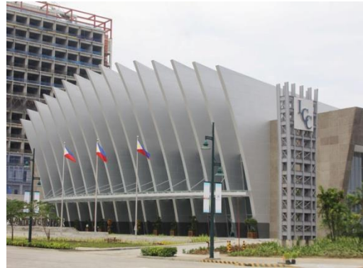
Iloilo Convention Center ready for the APEC meetings

A total of 52 infra projects were completed, with an aggregate cost of PH 1,048.164 Billion. Some of these notable projects included the construction of the following: Iloilo Convention Center in Iloilo, World War II Landmark, Historical Park and Pavilion in Nasipit, Agusan del Norte, Tourism Center New Public Grandstand in Cabarroguis, Quirino, cottages in Sibuan Cove, Davao, Calayan Island, foot bridge and wharf, pavilion and view deck of the first Easter mass ecological, historical and recreational Park in Butuan City. TIEZA has also completed the construction of tourist visitors' centers and green rest rooms in popular destinations like Aklan and Underground River in Puerto Princesa, cottages and convention center in Bislig, Surigao del Sur and construction of multi-purpose building with boardwalk in Donsol, Sorsogon.