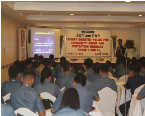
PNP participants attending the Seminar for national Tourist Oriented Police for Community Order and Protection (TOPCOP)

Further, the ADB-Canada Improving Competitiveness in Tourism Philippines (TA-8334 PHI) is still on-going. It is a project of the Asian Development Bank with the Department of Tourism as its implementing agency and funded by Government of Canada. It is part of the increasing competitiveness for inclusive growth which has commenced last November 2013.