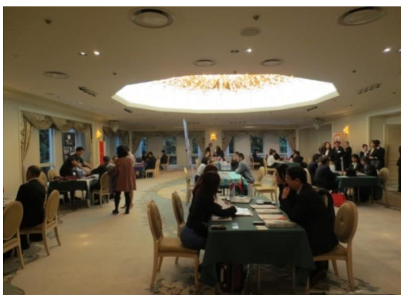
ESL Autumn Roadshow in Osaka

Likewise, to further improve our Philippine ESL products, the Department conducted site inspection of local ESL schools located in Cavite to assess and ensure that facilities, services and qualifications of teachers meet the qualification requirements of the ESL market. The DOT also partnered with the British Council to conduct a demo of the Teaching Knowledge Test (TKT) with ESL teachers in Baguio and Cebu.