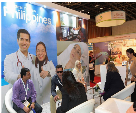
International Medical Travel Exhibition and Conference (IMTEC) held in Dubai in October 2015.

To keep abreast on the current trends in global medical travel and wellness tourism, the DOT undertook the conduct of research and networking with key industry players on medical travel and wellness tourism.