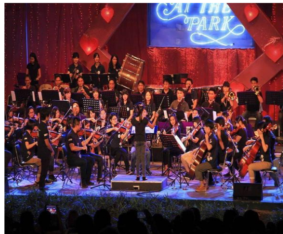
Concert at the Park

activities/exhibits held at the Rizal Park Visitor's Center, and four (4) Harana Para Kay Rizal and hosting of nine (9) events of national/historical significance to include the Feast of the black Nazarene, Pope Francis State and Pastoral Visit, Shell Eco Marathon, GomBurZa Death Anniversary, Independence Day, 200 th Birth Anniversary of Hermano Puli, National Day, Rizal Day 2015 (119 th Martyrdom of Dr. Jose Rizal), and Paco Park Plans Turn-over Ceremony.