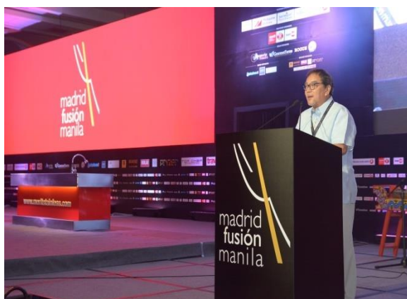
Tourism Secretary Ramon Jimenez, Jr. during Madrid Fusion 2015 held at the Mall of Asia

A total of forty two (42) participants representing nine (9) ASEAN member countries including Japan were able to experience adventure, culture and ecotourism product offerings of Bohol and Cebu such as visits to the Chocolate Hills and Philippine tarsier and wildlife sanctuary, Loboc river cruise and tree planting at Bohol Biodiversity Complex. The group was also treated to a city tour and visit to the University of San Carlos, one of the oldest university in the country.