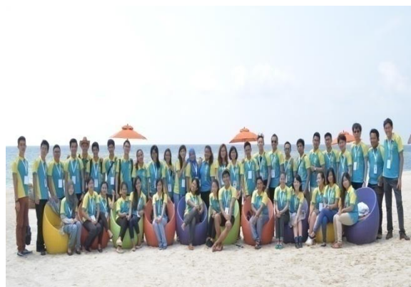
ASEAN Plus Three Tourism Youth Summit participants at the South Palms Resort, Panglao, Bohol

tourism industry stakeholders. The Forum also shared best practices in the ASEAN region in Gender responsive tourism particularly in promoting greater participation of women in leadership and decision making in the tourism sector.