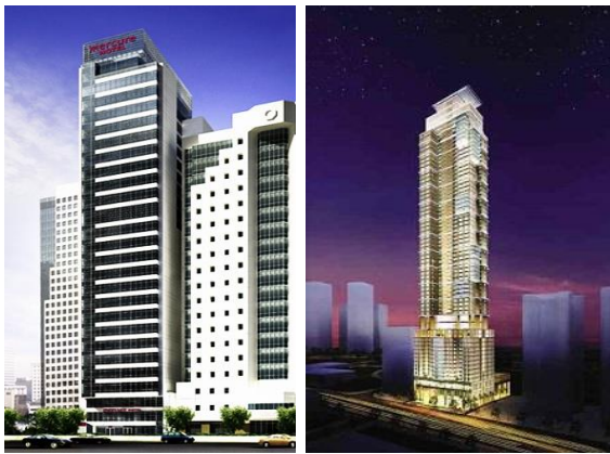
Mercure Hotel, Ortigas(left), Discovery Primea (Makati), right

The DOT also conducted series of RIA seminars with 87 participants from DOT and attached agencies as well as trainings with 350 local government officials from Cebu, Bohol, Davao, and Palawan. Focus group discussions with scuba diving agency (PADI), operators, establishments and professionals were undertaken to finalize the draft scuba diving rules and regulations. It also completed the survey on business and licensing permit system of 1,000 tourism establishments as well as that of tourism related establishments in Bohol, Cebu, Davao, Palawan, and Manila.