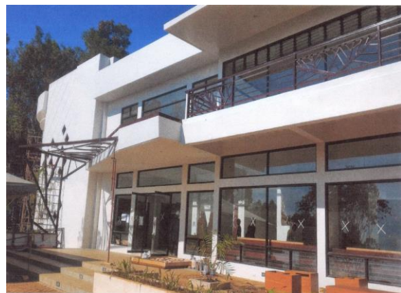
Visitor Information Center at Mt. Hamiguitan Range Wildlife Sanctuary ecotourism Park in Davao Oriental

It has also undertaken the restoration of the Carlos Botong Francisco mural at the Manila City Hall, rehabilitation of Banaue Hotel roofing in Banaue, Ifugao as well as the reconstruction of Loboc river terminal in Bohol. To develop Camp Manuel T. Yan as an ecotourism and tribal park, construction of ecotourism complex office, viewing deck and tribal houses were already completed. Likewise, with the inclusion of Mt. Hamiguitan Range Wildlife Sanctuary in Davao Oriental to the UNESCO World Heritage Site and at the same time increase its appeal as an ecotourism destination, construction of the Visitor's Information Center, Research Center Building and signage were completed.