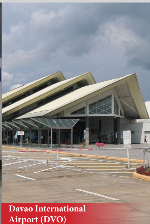
Davao International Airport (DVO)