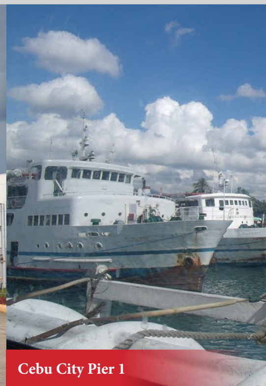
Cebu City Pier 1