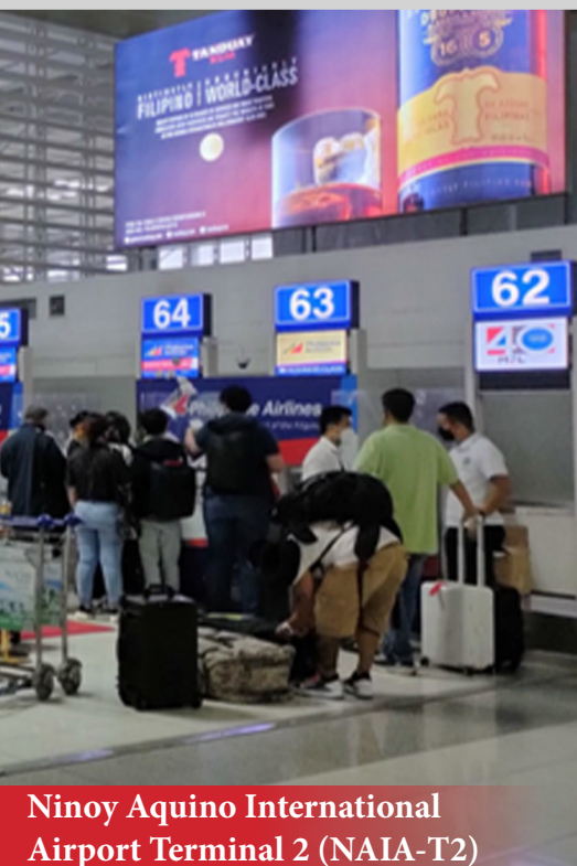
Ninoy Aquino International Airport Terminal 2 (NAIA-T2)

In addition to its recommendation to reinstate identified domestic and international flights, the DOT also proposes to strengthen its partnership with the DOTr on the aspect of air and sea routes development. DOT