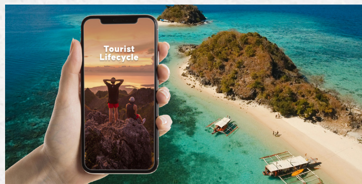
Tourist Lifecycle App