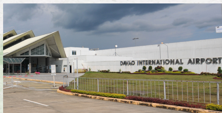
Improvement of land and sea tourist facilities

Sharing her enthusiasm with the House Members, Secretary Frasco gave a preview of the tourist service rest areas that the DOT will break ground across the country, with at least ten (10) to be placed in strategic locations in Luzon, Visayas, and Mindanao within this year.