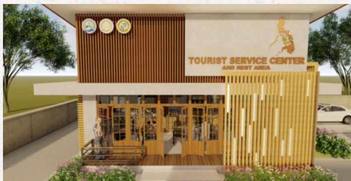
Tourist Service Rest Areas

The plans, according to Frasco, will include the establishment of tourist service rest areas and information counters across the country, the development of a tourist lifecycle app, a Tourist Assistance Call Center, and the launching of a guest incentive system, among others.