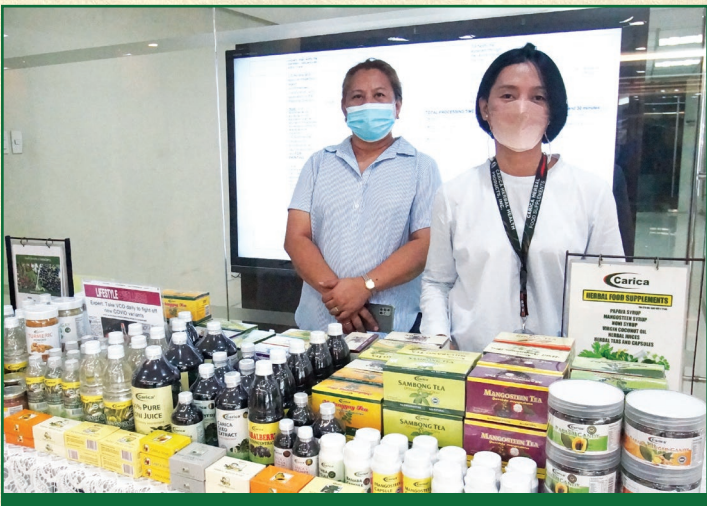
Beauty and Wellness Booths

CIVIL SERVICE ANNIVERSARY | WORLD TOURISM DAY | FAMILY WEEK