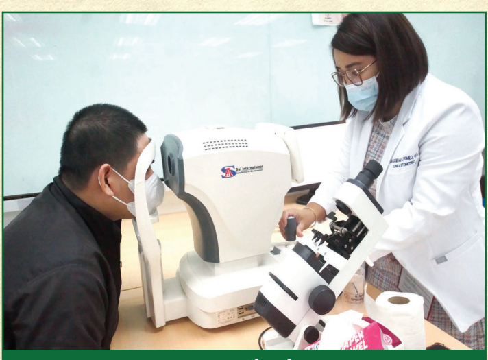
Free Eye Check-up

Mental & Health Talk: Anxiety Management