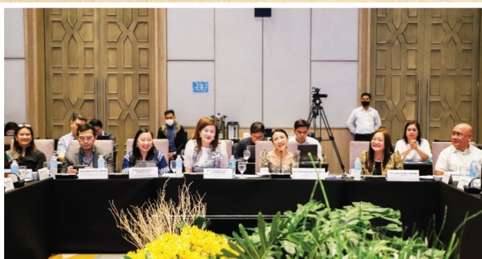
2023 Strategic Planning and Alignment Workshop for the Department's Foreign Offices