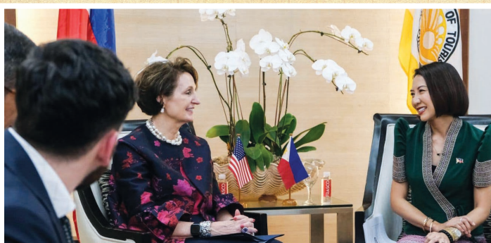
Courtesy visit of United States Ambassador to the Philippines, H.E. Mary Kay L. Carlson