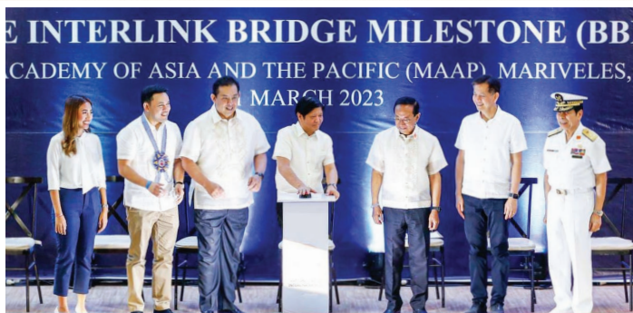
Ceremonial switching of the Bataan-Cavite Interlink Bridge