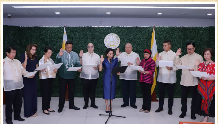
Induction of Tourism Congress of the Philippines officers