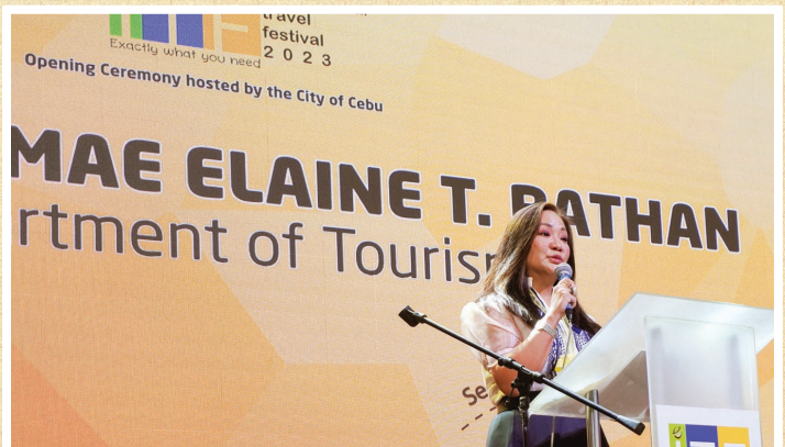
International Travel Festival - Philippines