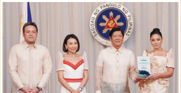
Awarding of Tourism Ambassador title to Vanessa Anne Hudgens