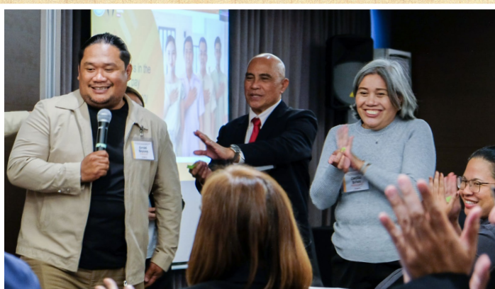
Filipino Brand of Service Excellence Train-the-Trainer Program