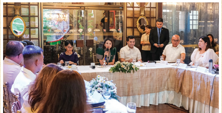
Listening Tour with Tour Guides and Associations