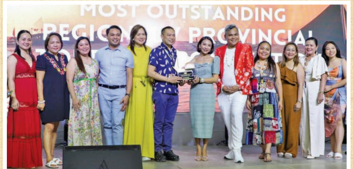
24 th Pearl Awards of the ATOP Association of Tourism Officers of the Philippines