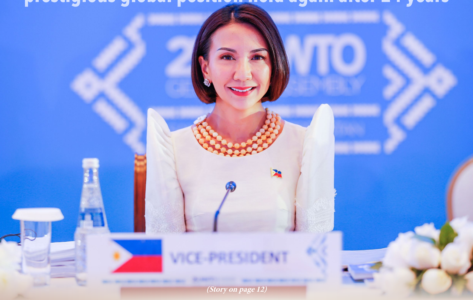
(Story on page 12)