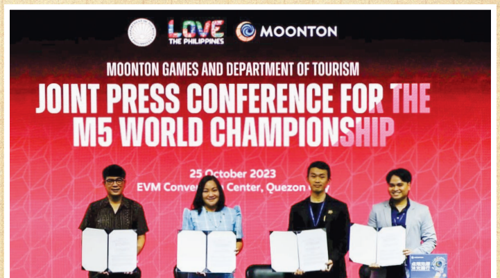
Joint Press Conference for the M5 World Championship