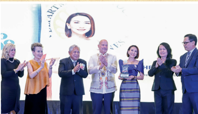
SKAL International Tourism Awards 2023