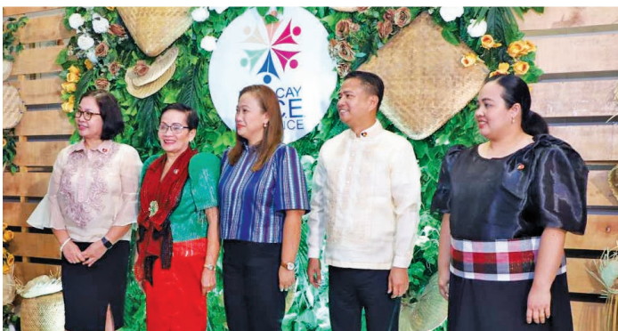
Meeting with Filipino Brand of Service Excellence trainers in Boracay Island