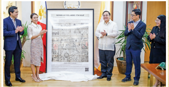
Turn over of the official replica of Murillo Velarde 1734 Map