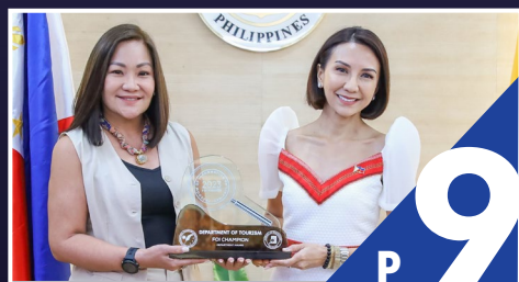
DOT wins FOI Champion Award