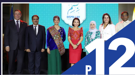
DOT gathers members of the diplomatic corps to promote Mindanao's halal cuisine and culture