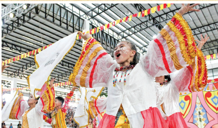
Saraotan sa Dalan 2023 in Palawan