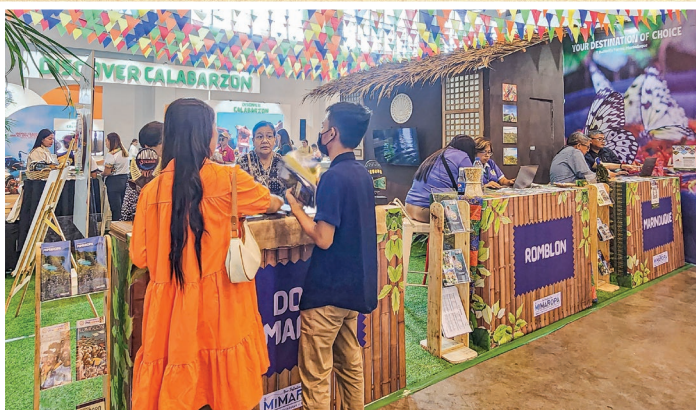
Central Philippines Tourism Expo