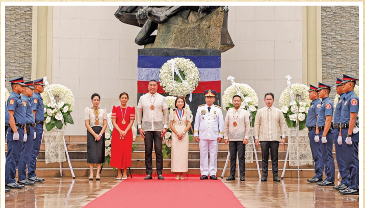
125 th Philippine Independence Day