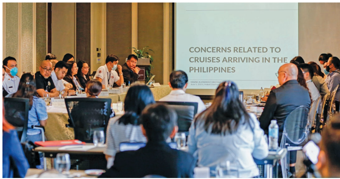
Cruise Alignment Meeting