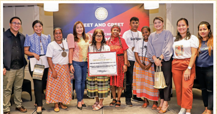
Turnover ceremony of livelihood assistance to Nagpana Minorities Association