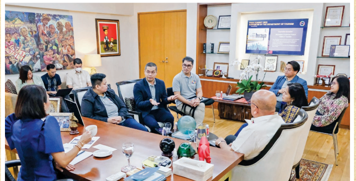
Courtesy visit of Philippine Financial and Inter-Industry Pride